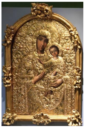
Fig. 9. The Virgin Hodegetria. Beginning of the XVIII century. Cross-exaltation church in the near caves, Kyiv