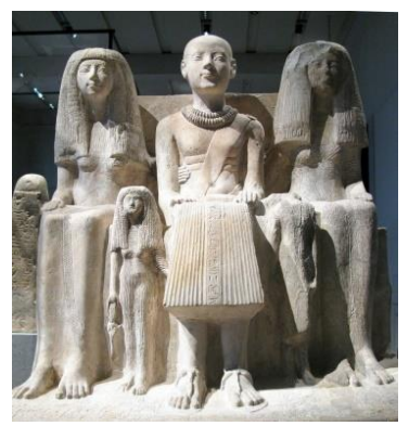
Fig. 4. The Ptahmey family group. New Kingdom. XIX Dynasty. 1250–1200 BC Egyptian Museum, Berlin