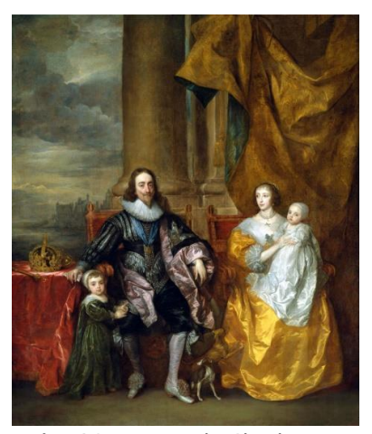
Fig. 16. Van Dyck. Charles I and his Family. 1632. Oil on canvas. 303.8×256.5. Palazzo Pitti, Florence