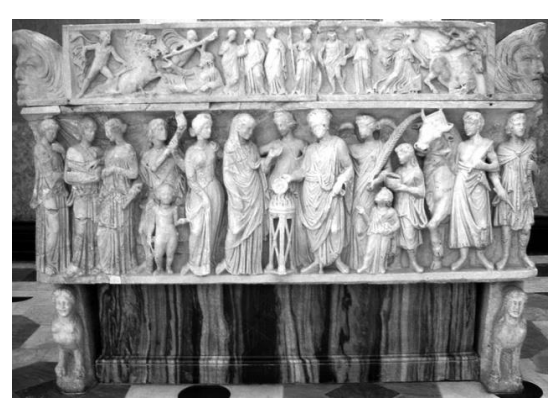
Fig. 5. Wedding ceremony. Roman sarcophagus. III century AD. The Hermitage, St. Petersburg