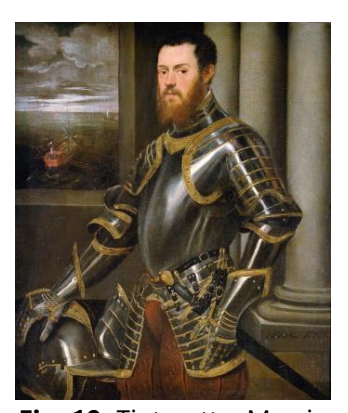
Fig. 19. Tintoretto. Man in Armor. 1550. Oil on canvas. 116×98. Museum of Art History, Vienna