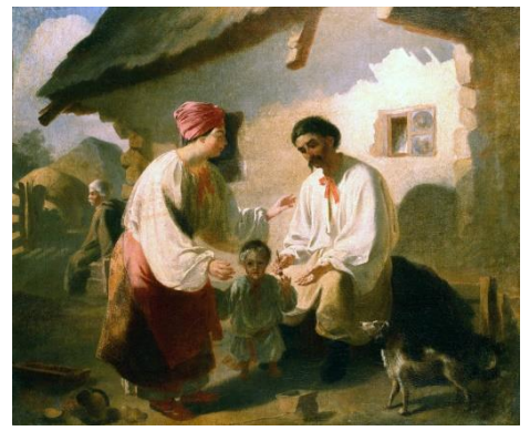
Fig. 18. T. Shevchenko. Peasant Family. 1843. P., oil on canvas. 60×72.5. National Museum of Shevchenko, Kiev