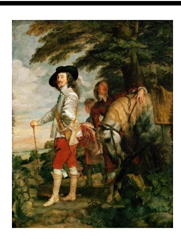
Fig. 21. Van Dyck. Charles I on horseback. 1635. Louvre Museum, Paris