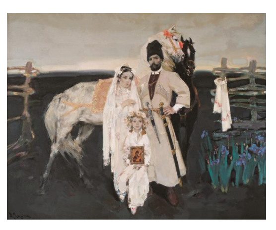
Fig. 2. M. Guida. Kuban wedding. Dedicated to great-grandfather Demyan Doroshenko. 2004. Canvas, oil. 170×230