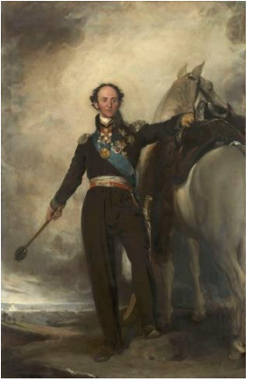
Fig. 22. Thomas Lawrence. Ataman Matvei Ivanovich Platov during a visit to England. 1814. Royal Collection, Windsor Castle