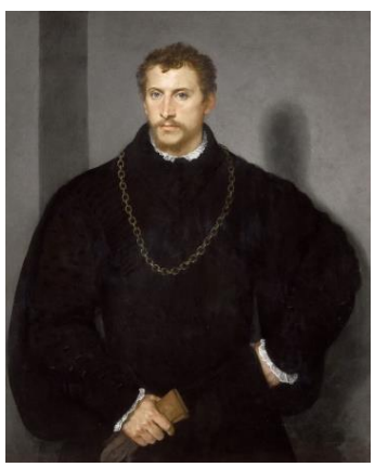
Fig. 3. Titian. Unknown with gray eyes. 1540–1545. Oil on canvas. 111×93. Pitti Palace, Florence