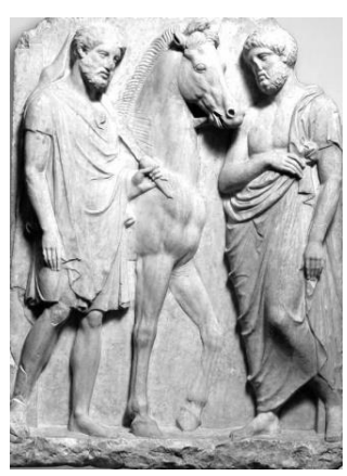
Fig. 20. Tomb of the Athenian horseman. Greece, 380s BC, Pushkin Museum of Fine Arts, Moscow