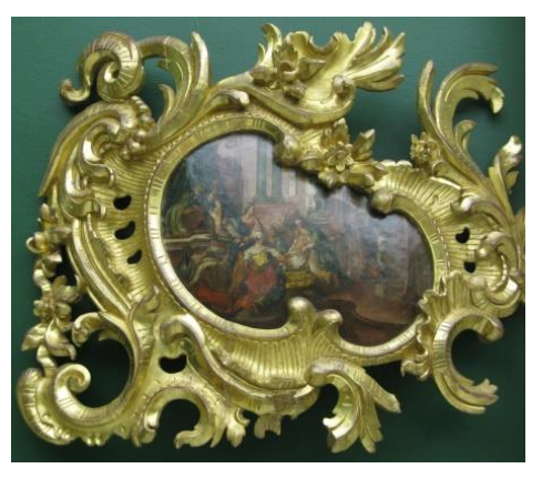
Fig. 15. Sysoi Shalmatov. Carving. Nativity of the Virgin. Ukrainian Baroque decor. Poltava. 18th century. National Art Museum of Ukraine, Kiev