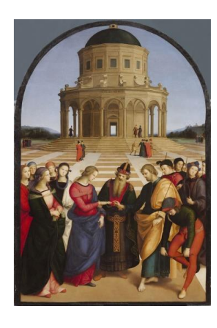
Fig. 8. Raphael. Spozalizio (Marriage of the Virgin). Board, oil. 170×117. Pinacoteca di Brera, Milan