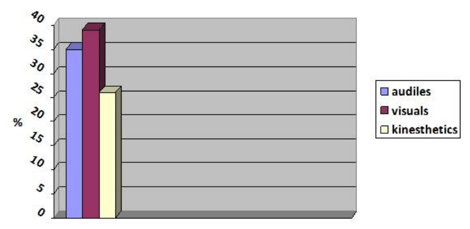
Fig. 2. Distribution of students of the experimental group, depending on the dominant channel of perception information

Fig. 1. Sensor arrangement during the polygraph examination The results of all tests are summarized. The students are divided into three groups: audiles, visuals, and kinesthetics on the basis of the results of all tests.